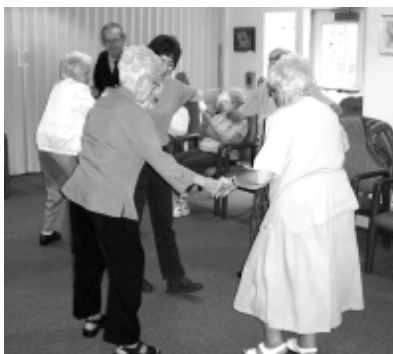
Music and movement allow people to express themselves even if they have difficulty speaking. Here participants share their enjoyment of the rhythm of a song.

Note: Our current funding allows us to offer Dance/Movement Therapy twice a month -- but we'd love to be able to offer it more often. If you're interested in making a directed donation to help expand this wonderful program, please call our Development Department at (401) 946-9220.