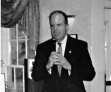
Lieutenant Governor Charles Fogarty speaks to the many participants, family members, friends and volunteers who attended the Celebration of Accomplishment.