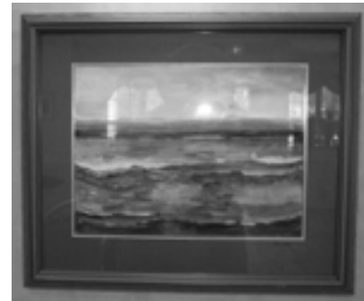
Two of the many beautiful paintings created by participants as part of the Art Program. The dazzling sunflower at left was painted by Phyllis John and the subtle and intricate sunset at right is the creation of Olga Quilici.