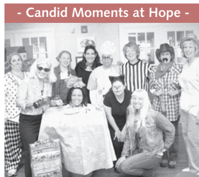
Trick or Treat... Hope Center staff changed into a rock star, devil, clown, cowboy and more fun costumes (even a table!) to celebrate Halloween!