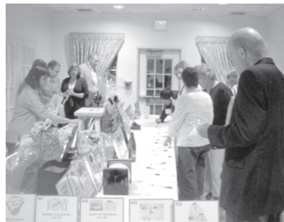
Guests carefully review the wide selection of silent auction items before placing their bids. This year, Soiree guests had the opportunity to eliminate potential competition in the silent auction and secure the winning bid with the new "Own it now!" option.